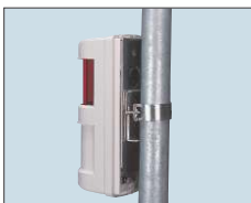
● Pole attachment <BP-22>