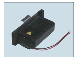
● Dedicated emergency power supply <BA-20A>