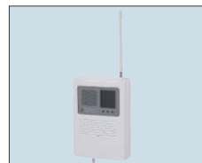
● Repeater (For bidirectional wireless/registration type) <RTX-300>