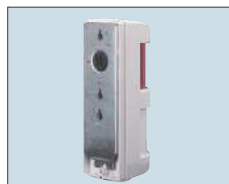
● Wall mounting bracket <BW-24>